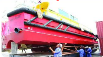
The Pilot Boat; "Tareem" is back in service after receiving maintenance at the technical workshop of Mukalla seaport